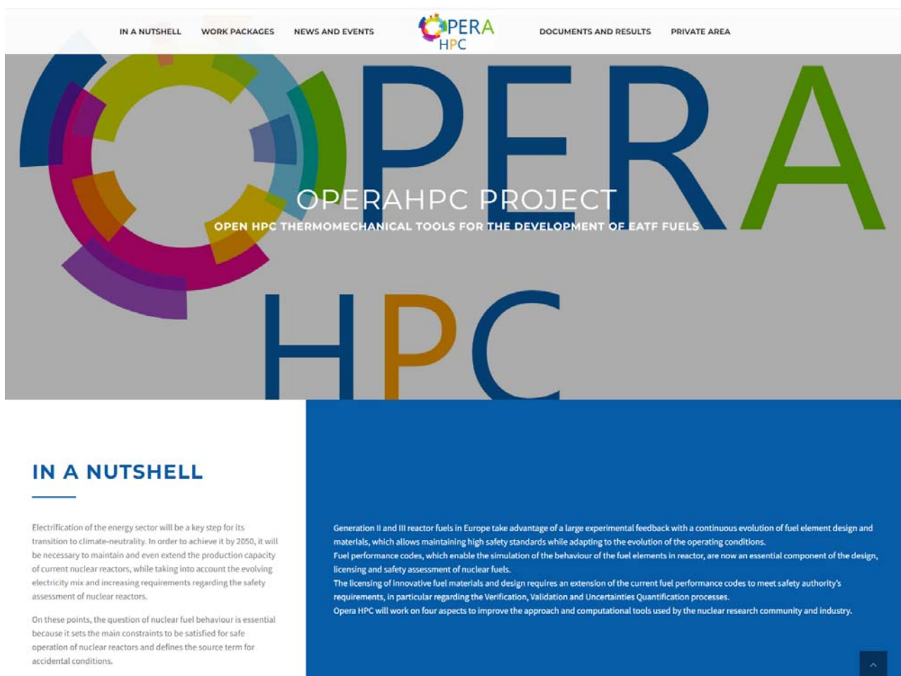
Figure 2: Screenshot of OperaHPC website

The first newsletter is planned for mid 2023.